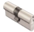
Profile double cylinder for every door