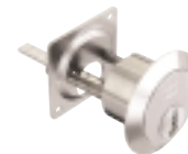
Exterior cylinder e.g. for extra rim locks